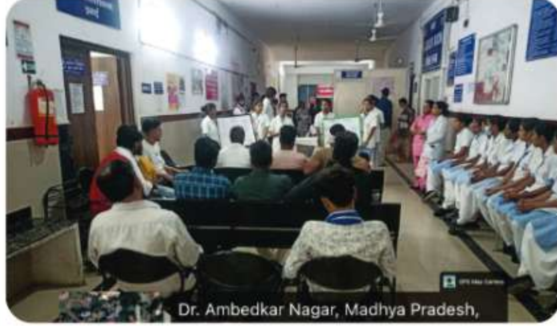
Dr. Ambedkar Nagar, Madhya Pradesh,

On the occasion of World No Tobacco Day B.Sc. Nursing final-year students conducted a health awareness talk in Madhya Bharat, where they informed people about the harmful effects of tobacco use, its hazards and preventive measures, encourage the people to contribute in making a healthier and tobacco-free society.