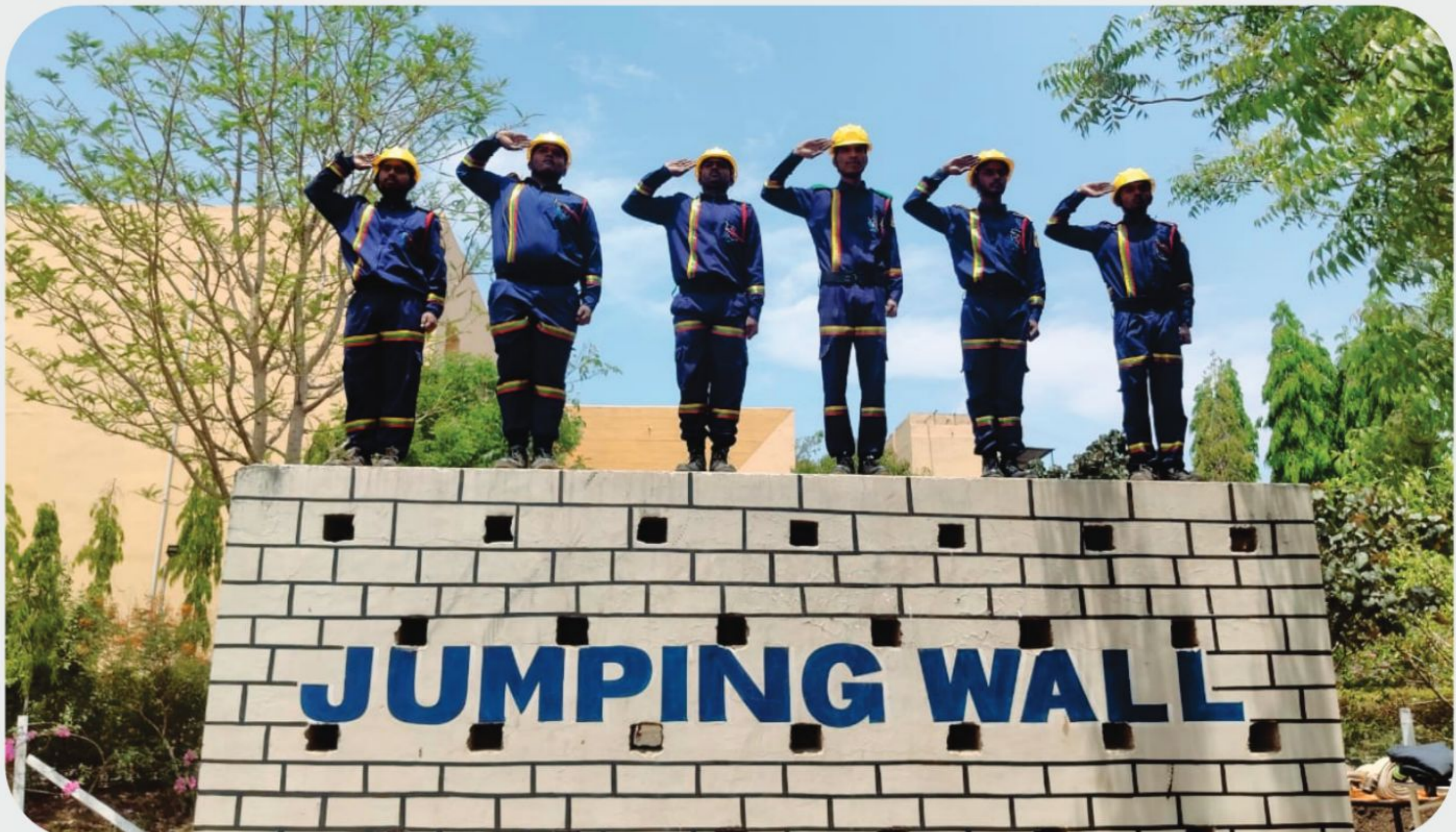
Students of FTSE Celebrating Fire Service Week 2026