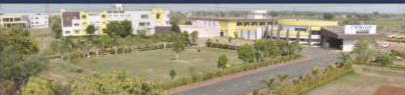
Vikrant Group of Institutions GWALIOR CAMPUS

To make Vikrant Group of Institutions the center of excellence and catapult its students to a path leading to the pinnacle of success, as well as groom them as future visionaries and entrepreneurs.