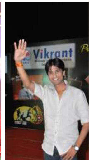
Dr. Kumar Vishwas Renowned Indian Poet