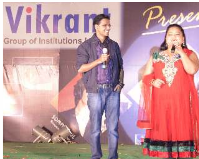
Bharti Singh Comedian